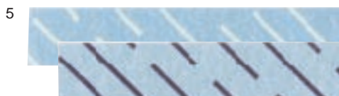
Steam Tape for Disposable Wraps